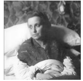
"Lord, I do not ask You for the glory of your visions, but for the grace to love You more and more." ( Notebooks 1944 , p. 439.)

New email address: david@valtorta.org.au ; Web-site: www.valtorta.org.au