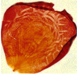
The Lord bless you and keep you; The Lord make His Face shine upon you, and be gracious to you; The Lord lift up His countenance upon you, and give you peace. (Num. 6:24-6.)